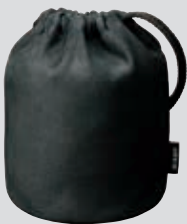
Lens case CL-1218