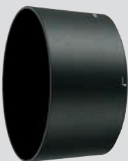
Lens Hood HB-79